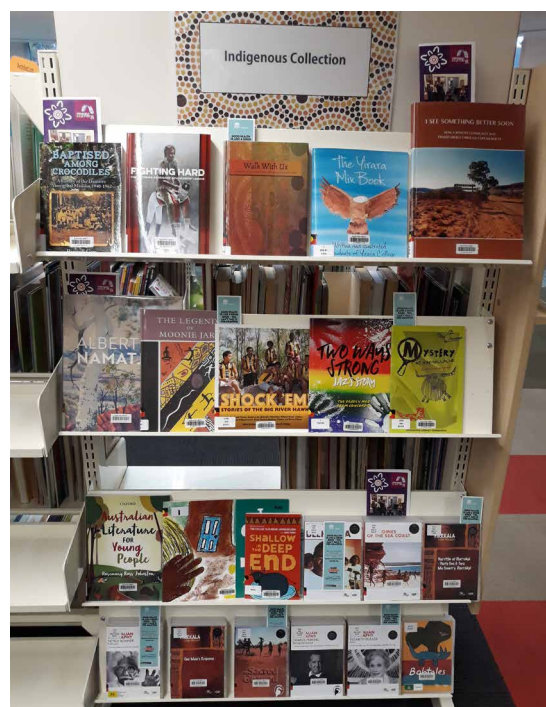
Indigenous collection, Blacktown City Libraries