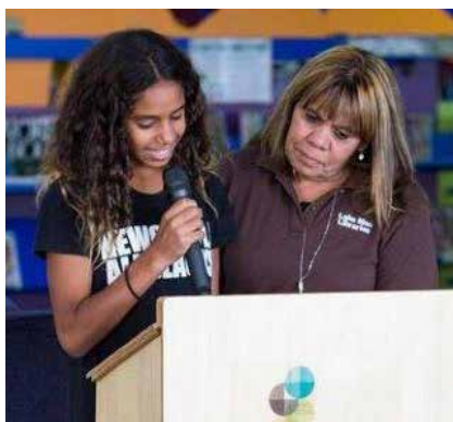
Speaker event, Lake Macquarie Library