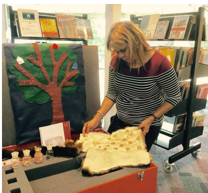
Possum Skin Cloak educational kit, Lake Macquarie Library