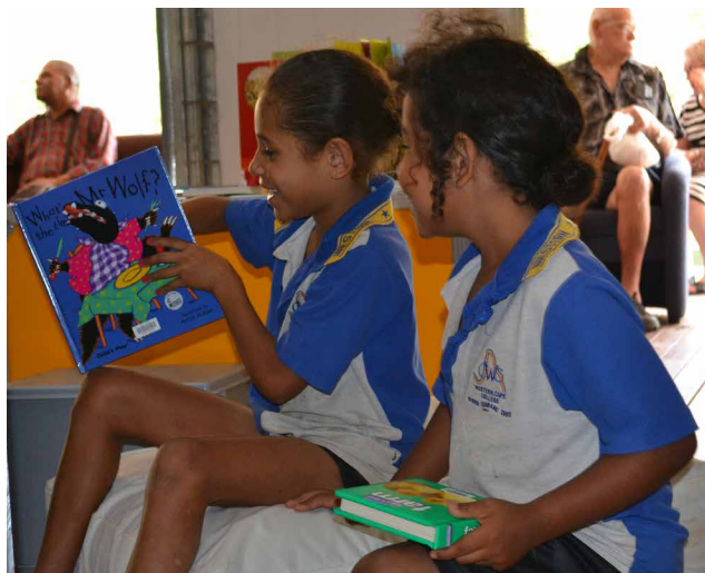
Ideas Box, State Library of Queensland