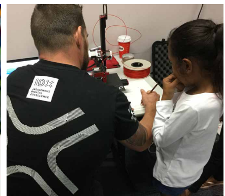
IDX Flint program, Lake Macquarie Library