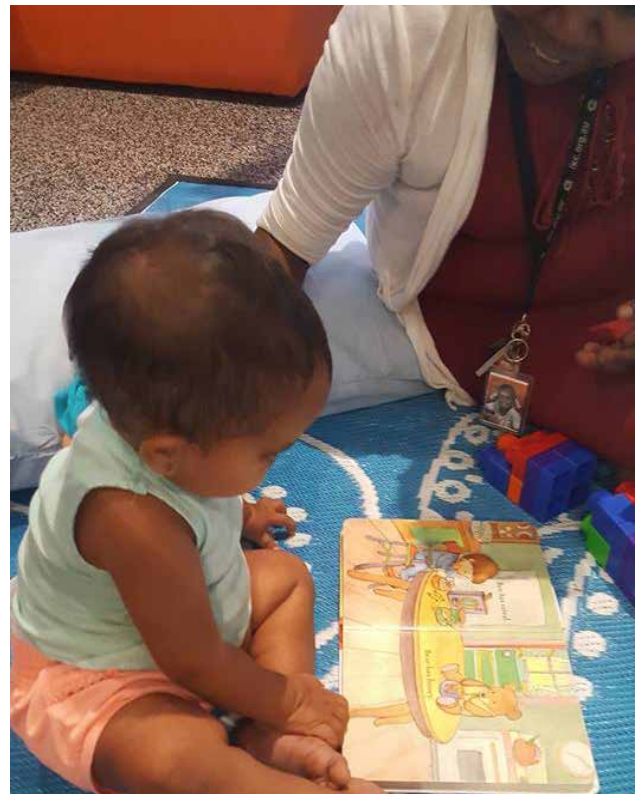
Yarrabah Knowledge Centre, State Library of Queensland

The DDC program encourages Aboriginal and Torres Strait Islander peoples to dream big through digital literacy to create and unlock new opportunities and new possibilities for themselves and their community. The program provides community-based digital literacy and technology training over two years to 26 remote and regional Aboriginal and Torres Strait Islander communities in Queensland. Participants will learn digital skills like sending an email, using social media, paying bills online, promoting a new business idea and more.