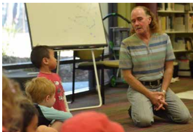
Mother Language Day, Libraries ACT