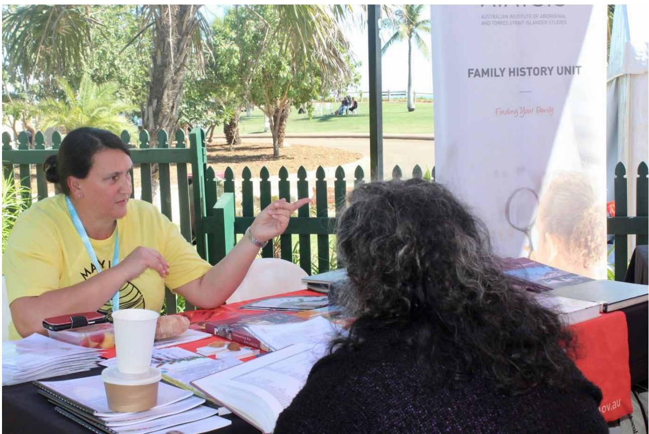
Family History Unit staff providing advice, National Native Title Conference, AIATSIS

The Family History Unit provides support and research assistance to Aboriginal and Torres Strait Islander peoples who are researching their family history. Research requests can begin through the free 1800 number or online, using the Finding Your Family Indigenous family history toolkit, which is available to everyone. This is supported by specially curated resources from the AIATSIS and other collections and services. AIATSIS also supports family history research through the online Aboriginal and Torres Strait Islander Biographical Index records available through Trove; professional training through the Certificate IV Stolen Generation Family History and Casework; as well as ad hoc training sessions provided at AIATSIS in Canberra. AIATSIS specifically supports the Stolen Generations in their research through Link-up services.