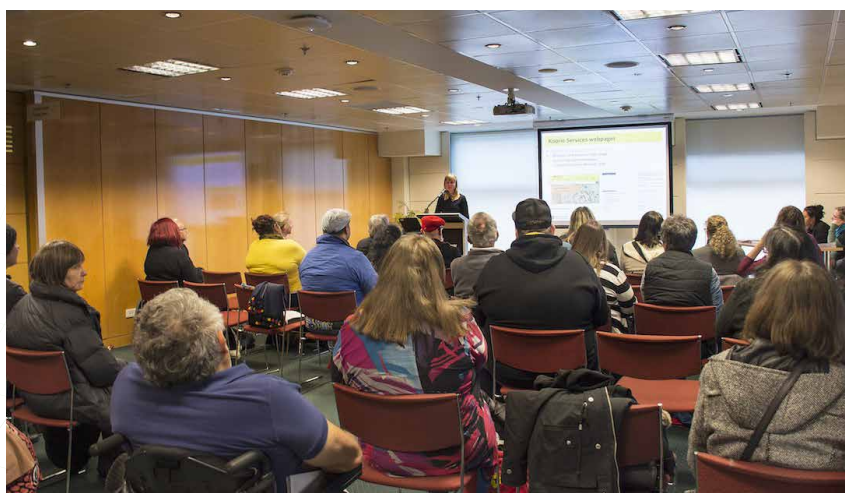
Sessions on Aboriginal family history day, State Library of Victoria.