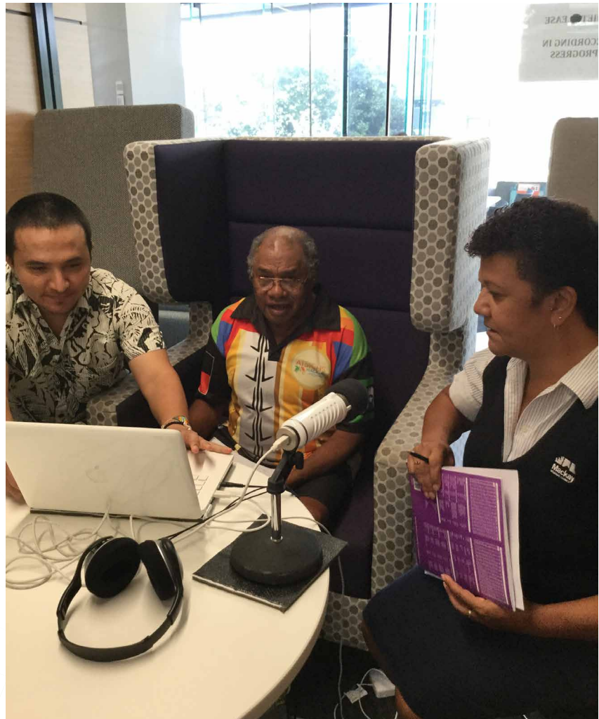
Yuwibara language project, State Library of Queensland

One such example has been the Yuwibara language of the Mackay Region which was considered 'lost'. Since 2015 State Library in partnership with Mackay Regional Libraries has assisted Mackay communities to rebuild their language from historical sources. The outcome will be a community dictionary and language app with over 1,000 words from Yuwibara and neighbouring languages.