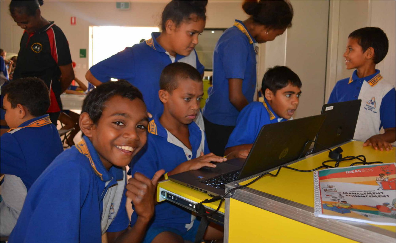
Ideas Box, State Library of Queensland