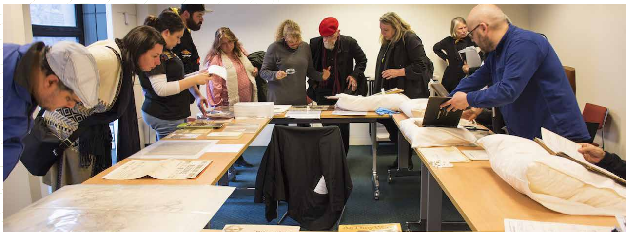
Collection viewing, State Library of Victoria.