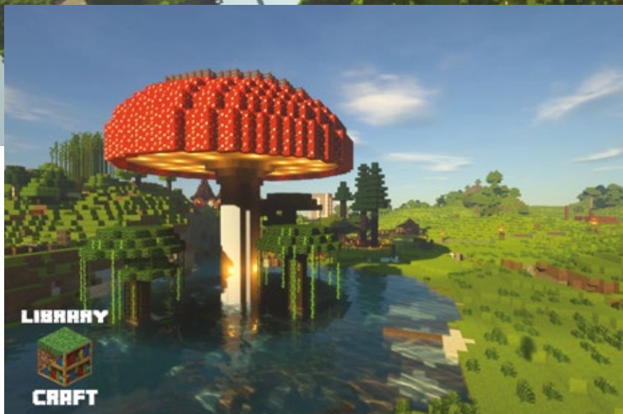
Above: LibraryCraft Lobby World. Left: Giant Mushroom House – Old Survival World.