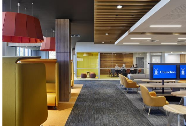
Hanly Learning Centre, St Joseph's Nudgee College Queensland (left) was the winner of the 2017 ALIA Library Design Awards school libraries category, followed by Churchie Centenary Library, also Queensland, in the 2019 awards (right).

In universities and TAFEs, libraries continue to provide a core study space for students. While new acquisitions are more than 95% digital, tertiary education libraries are as well used as ever, providing learning commons areas for individual and group study.