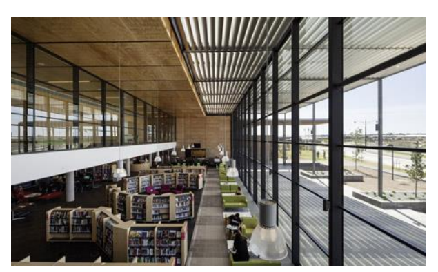
Craigieburn Library by Francis Jones Morehen Thorp

These Victorian public libraries are good examples of the kind of developments which can be found across Australia.