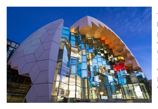
Alistair Roche (Own work) [CC BY-SA 4.0] via Wikimedia Commons

The award-winning Geelong Library is located in the heart of Geelong's creative precinct. It is an outstanding piece of architecture that captures the eye but does not dominate its community. It balances the traditional with the progressive and will stand as an example of how a contemporary public library can act as an inspiration for its community for many decades to come.