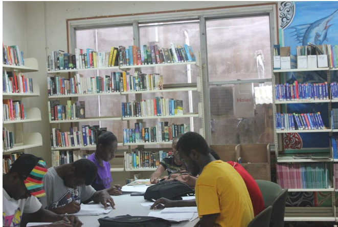
Port Vila Public Library, Vanuatu