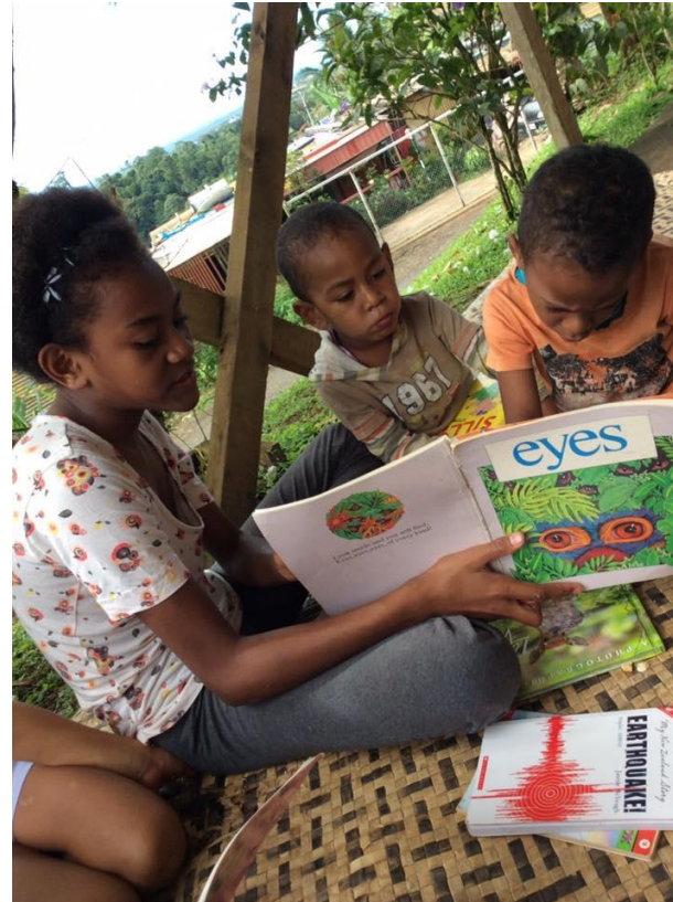
Sunday Book Club, Suva, Fiji