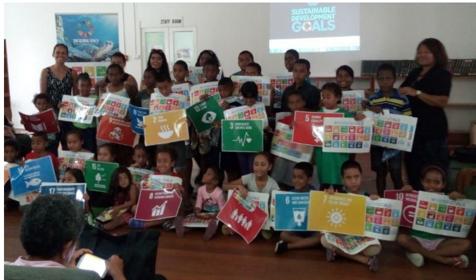
Suva City Carnegie Library