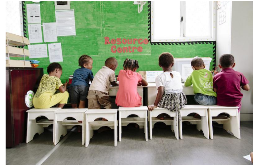
Buk Bilong Pikinini, Papua New Guinea